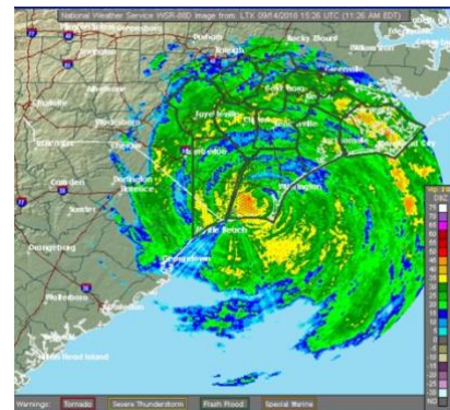
Hurricane Florence Camp Monroe was in the path of Hurricane Florence. How are things now?