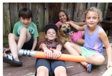
Opening Campfire is for fun, friends, and fellowship.