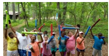
The High Ropes course allows for a challenge for all.