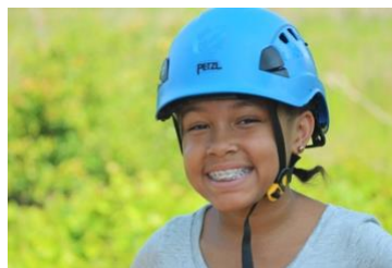
Happy, safe, enthusiastic, and caring staff.

Camp Monroe is here to serve. Our mission is to provide a place where relationships with God, others, and creation are nurtured and where Christ's call to discipleship is discovered. As a Servant Keeper, you help ensure our mission is fulfilled through larger operations. From resurfacing the road to updating infrastructure, you enable the camp to continue its mission for another 60 years.