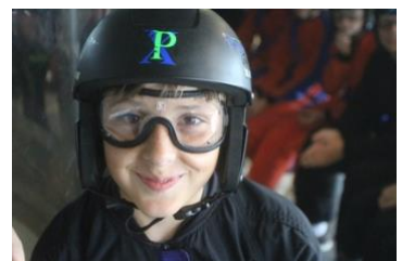
Smiles all around for everyone at Camp Monroe!